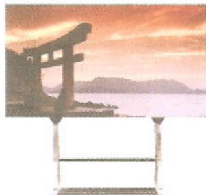
Nippura Blue Ocean

Sencore has launched their new portable digital audio generator, DAOS161 , capable of producing stereo, Dolby Digital 5.1, DTS-ES 6.1, and PCM digital audio using coaxial or TosLink outputs. It includes eight theatre calibration tests, and allows for running automated or manual tests, with a frequency reproduction range of 20 Hz to 20 kHz. ■