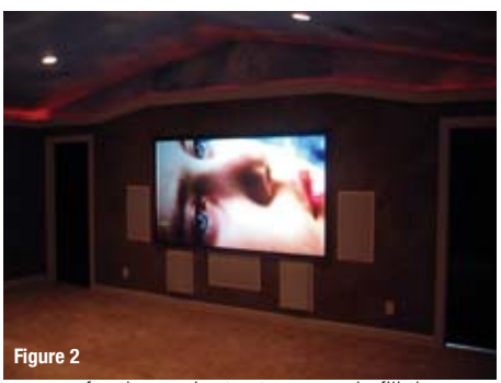
screen for the projector to properly fill the screen.

There are several ways to reduce that distance even more. Some projector manufactures have shorter throw lenses, such as 0.64:1. The space occupied by the projector can be eliminated (Figure 1) or up to a 35 percent reduction in space (Figure 2) can be achieved by just having your A/V integrator add a first surface mirror mount and fold the projection path.