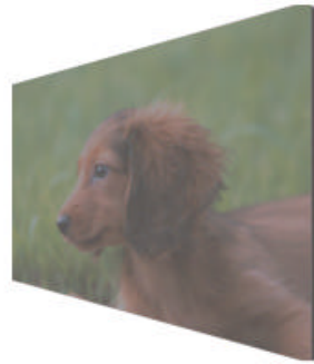
Traditional screen at angle