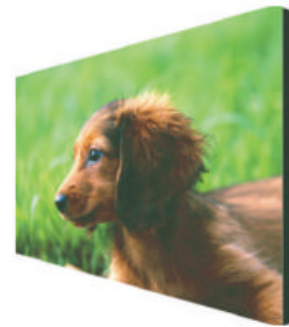
BLUE OCEAN screen at angle A brilliant, uniform, and extremely wide viewing cone.