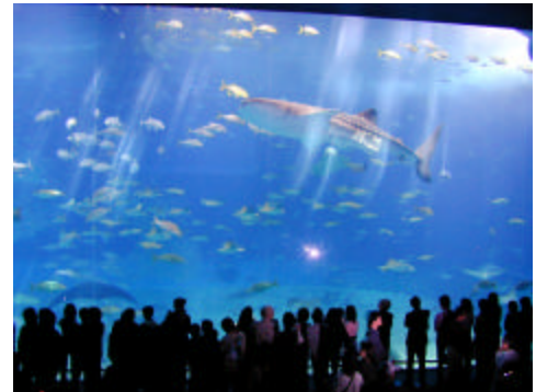
Not a projection, actual photo of Okinawa Aquarium Tank through Nippura Aqua-wall®

Nippura is known for its core business of creating the world's largest acrylic panels, tunnels, cylinders and spheres for the professional aquarium industry. Nippura was the first company ever in 1968 to produce a large scale aquarium from acrylic (PMMA). Nippura has been the catalyst for the modernization of theme park aquariums. While Nippura Aquarium products can be found all over the world you may find yourself staring through them at some of the more local notable aquariums like the Monterey Bay Aquarium, Atlantis Paradise Island, Baltimore Aquarium, New York Aquarium, Ripley's Aquarium Gatlinburg, & the new Georgia Aquarium just to mention a few... The largest size Aquarium Window Aqua-wall® created to date by Nippura measures more 74' x 27' x 2' thick (297,000lbs) and listed in the 2004 Guinness Book of Records. Nippura's technology for consistently producing hi-tolerance cell cast acrylic in large sizes with exacting optical properties has been leveraged for developing Blue Ocean® Rear Projection Screens.